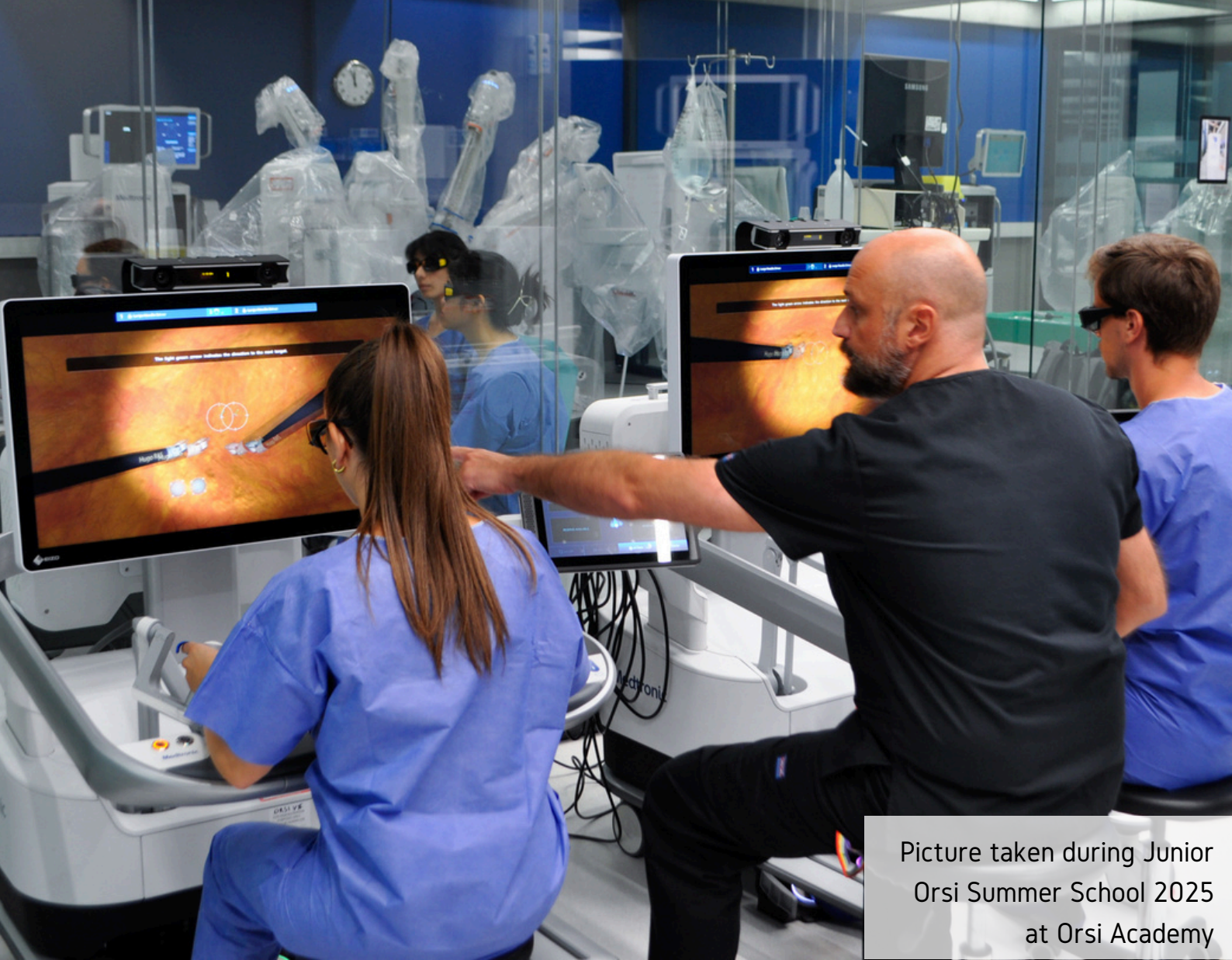
Picture taken during Junior Orsi Summer School 2025 at Orsi Academy